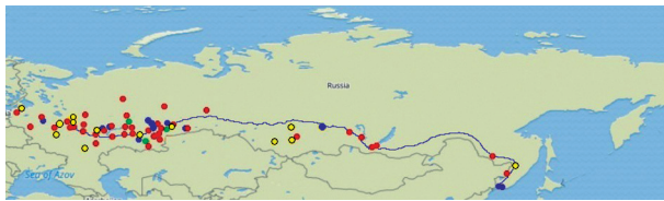
Figure 1 The secondary range of Collomia linearis Nutt. in Russia (GBIF 2025b). Periods of secondary range formation: green dots – period 1942–1962; blue dots – period 1963–1983; yellow dots – period 1984–2004; red dots – period 2005–2025. The blue line: Trans-Siberian railroad